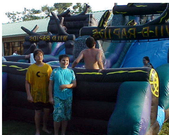
Photos were taken on the final day: after a happy assembly, participants were treated to giant water slides, pop-

Vacation Bible School was held June 25-29 with Diamondhead Methodist Church and a terrific group of volunteers from Kentucky who planned and led the week's events around the "Plunge into Jesus" theme. Among other things, the children learned obedience, courage, and faith.